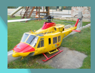
Public Regional System